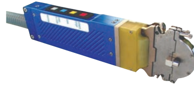
ORBIWELD 12 with narrow clamping cartridge (Type "A")