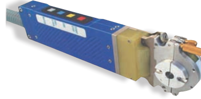
ORBIWELD 12 with wide clamping cartridge (Type "B")