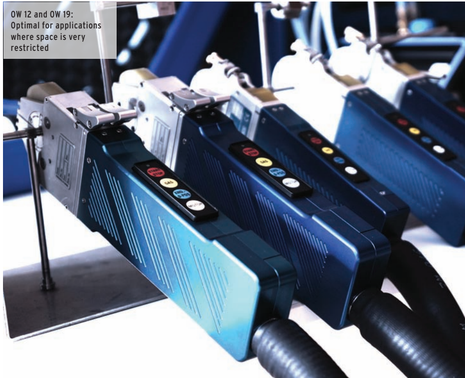
OW 12 and OW 19: Optimal for applications where space is very restricted

The small dimensions of the OW 12 and OW 19 weld heads make it ideal for applications where space is very restricted, such as the semiconductor industry, aerospace, pharmaceutical industry as well as the ultra pure water supply sectors. Particularly suitable for welding all common microfittings.